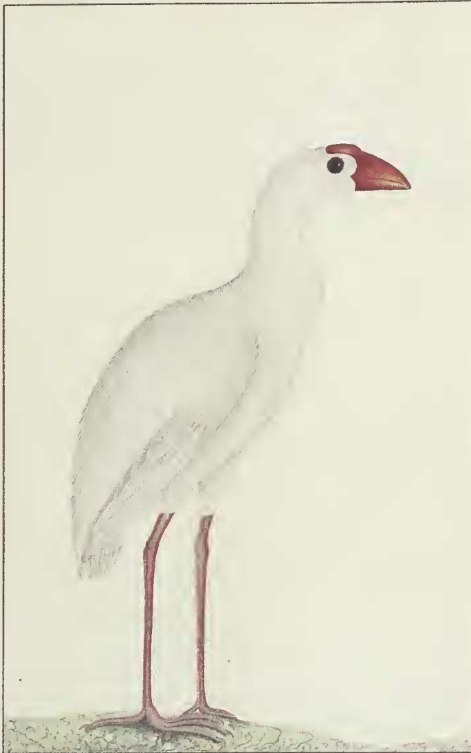
GROUND-BIRD of LORD-HOWE-ISLAND. Natural size. 1790

[sailors] also found on it, in great plenty, a kind of fowl, resembling much of the Guinea fowl in shape and size, but widely different in colour; they being in general all white, with a red fleshy substance rising, like a cock's comb, from the head, and not unlike a piece of sealing-wax. These not being birds of flight, nor in the least wild, the sailors availing themselves of their gentleness and inability to take wing from their pursuits, easily struck them down with sticks'.